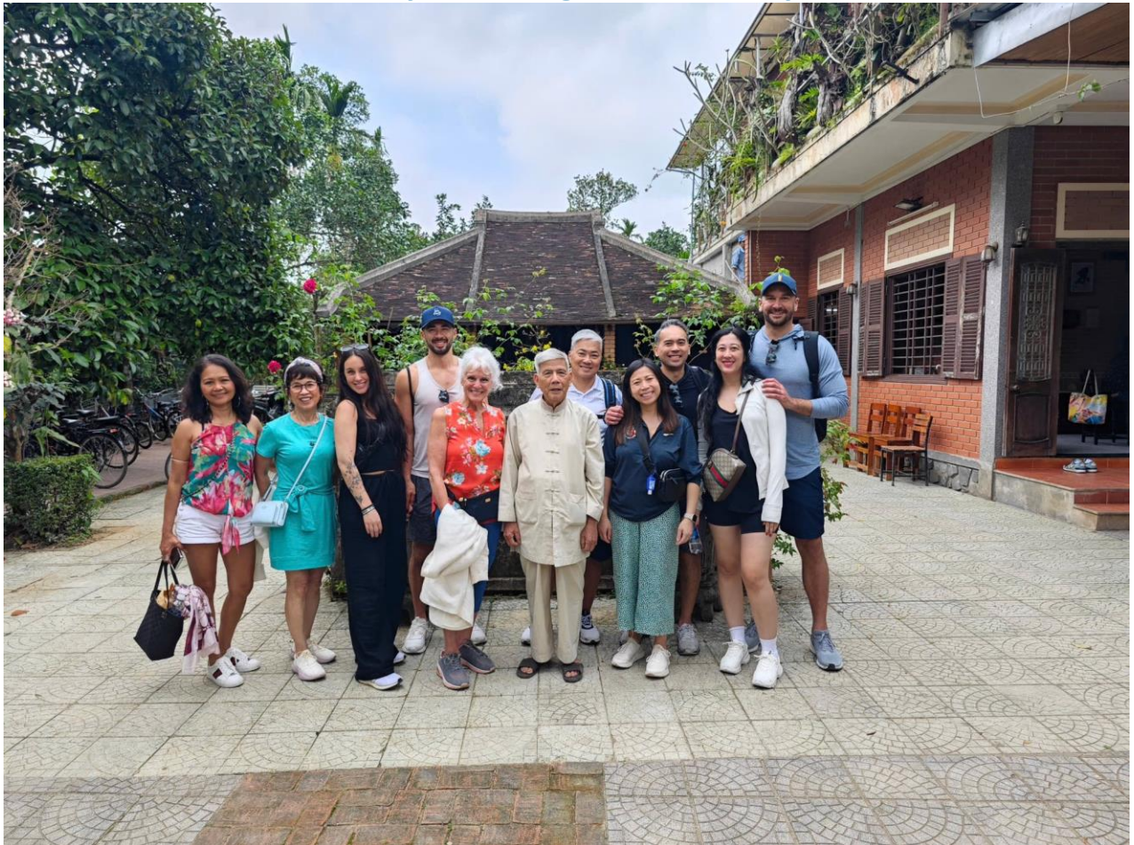
(Image: Visiting an old house in Thuy Bieu Village – Hue – Vietnam)