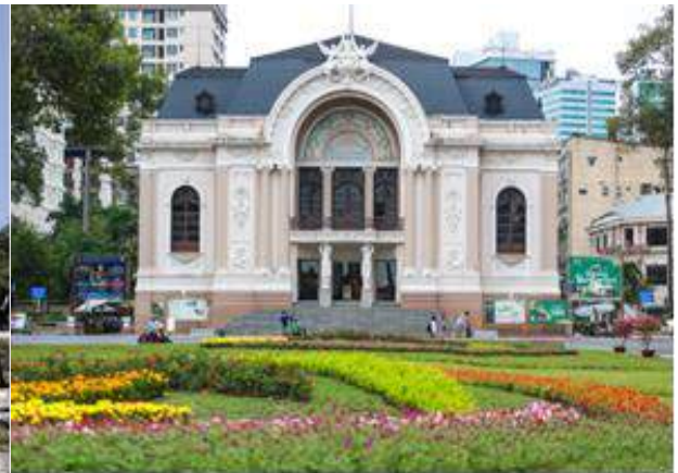
(Image: 1. Notre Dame Cathedral; 2. Opera House – Ho Chi Minh – Vietnam)