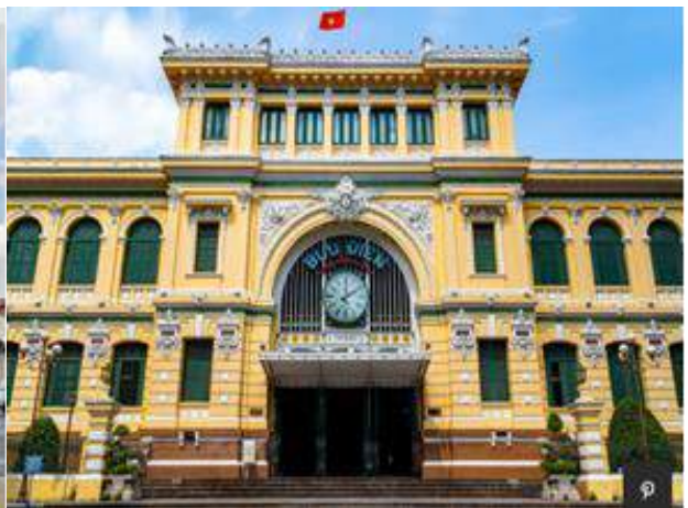
(Image: 1. Ben Thanh Market; 2. Ho Chi Minh Post Office – Ho Chi Minh – Vietnam)