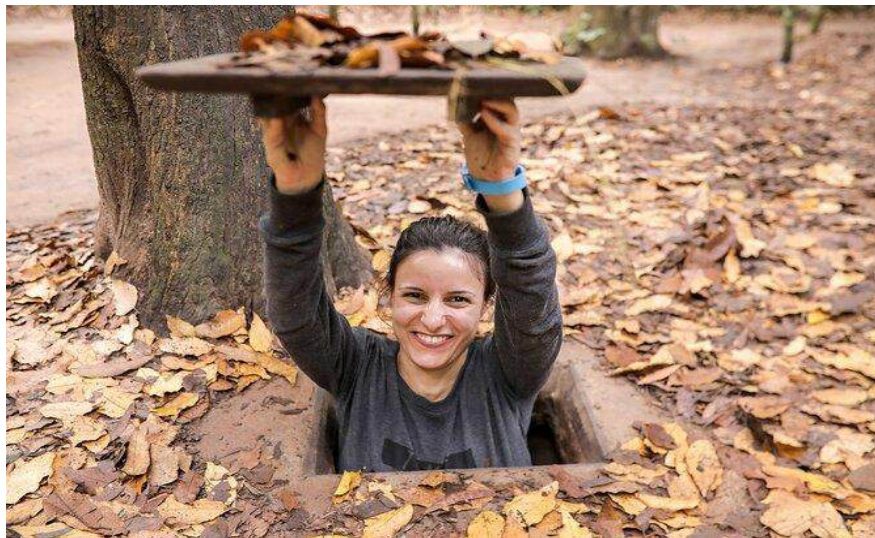
(Image: Crawling through a tunnel - An unforgettable experience in Cu Chi Tunnels – Ho Chi Minh)