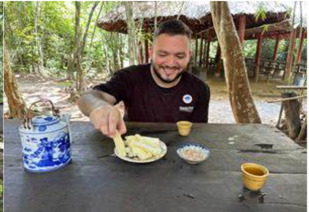
(Image: Our traveler is trying Cassava in Cu Chi Tunnels – Ho Chi Minh – Vietnam)