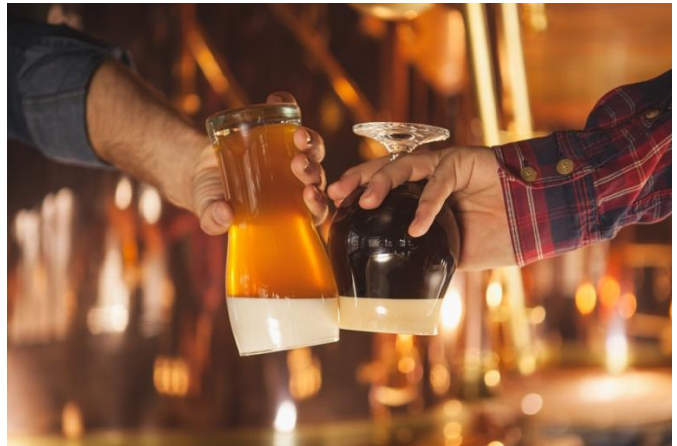
(Image: Featured stops on the Saigon Craft Beer Tour– Ho Chi Minh – Vietnam)