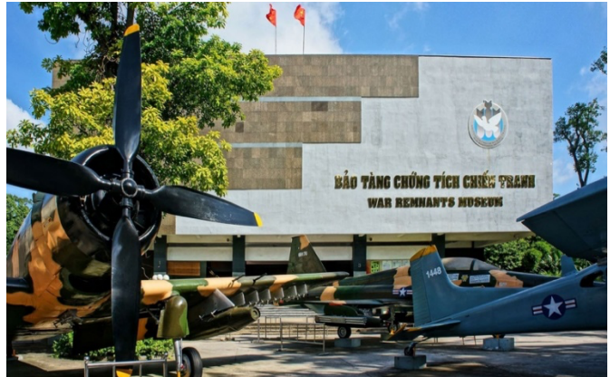
(Image: 1. Notre Dame Cathedral, 2. War Remnants Museum – Ho Chi Minh – Vietnam)