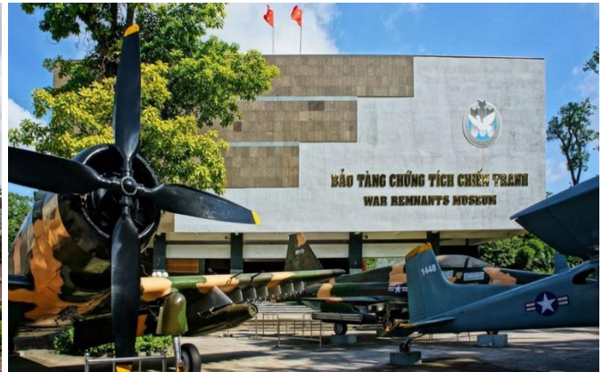
(Image: 1. Notre Dame Cathedral, 2. War Remnants Museum – Ho Chi Minh – Vietnam)