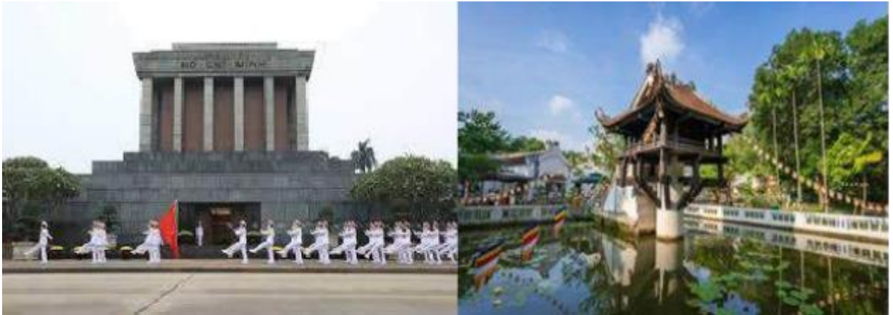
(Image: 1. Ho Chi Minh Mausoleum; 2. One Pillar Pagoda – Ha Noi – Vietnam)

Office: 3 Hung Hoa St | Hai Chau Dist | Da Nang | Viet Nam Australia Representative: 6 Hinton St | Runcorn QLD 4113 Hotline: +61481957246 / +84905122315 Email: info@vietnamlovelytravel.com Website: http://www.vietnamlovelytravel.com International Tour Operator Licence No: 48-297/2022 /TCDL-GP LHQT