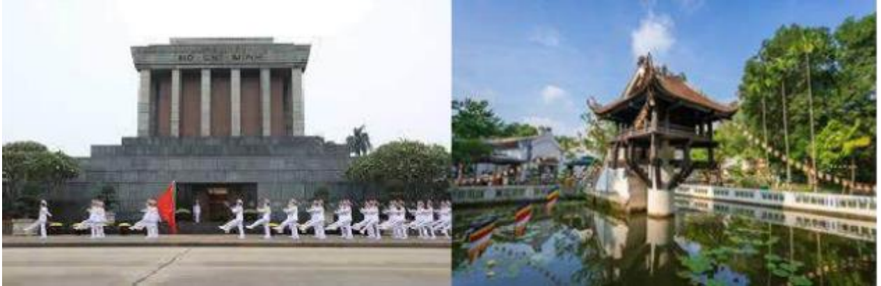
(Image: 1. Ho Chi Minh Mausoleum; 2. One Pillar Pagoda – Ha Noi – Vietnam)

Office: 3 Hung Hoa St | Hai Chau Dist | Da Nang | Viet Nam Australia Representative: 6 Hinton St | Runcorn QLD 4113 Hotline: +61481957246 / +84905122315 Email: info@vietnamlovelytravel.com Website: http://www.vietnamlovelytravel.com International Tour Operator Licence No: 48-297/2022 /TCDL-GP LHQT