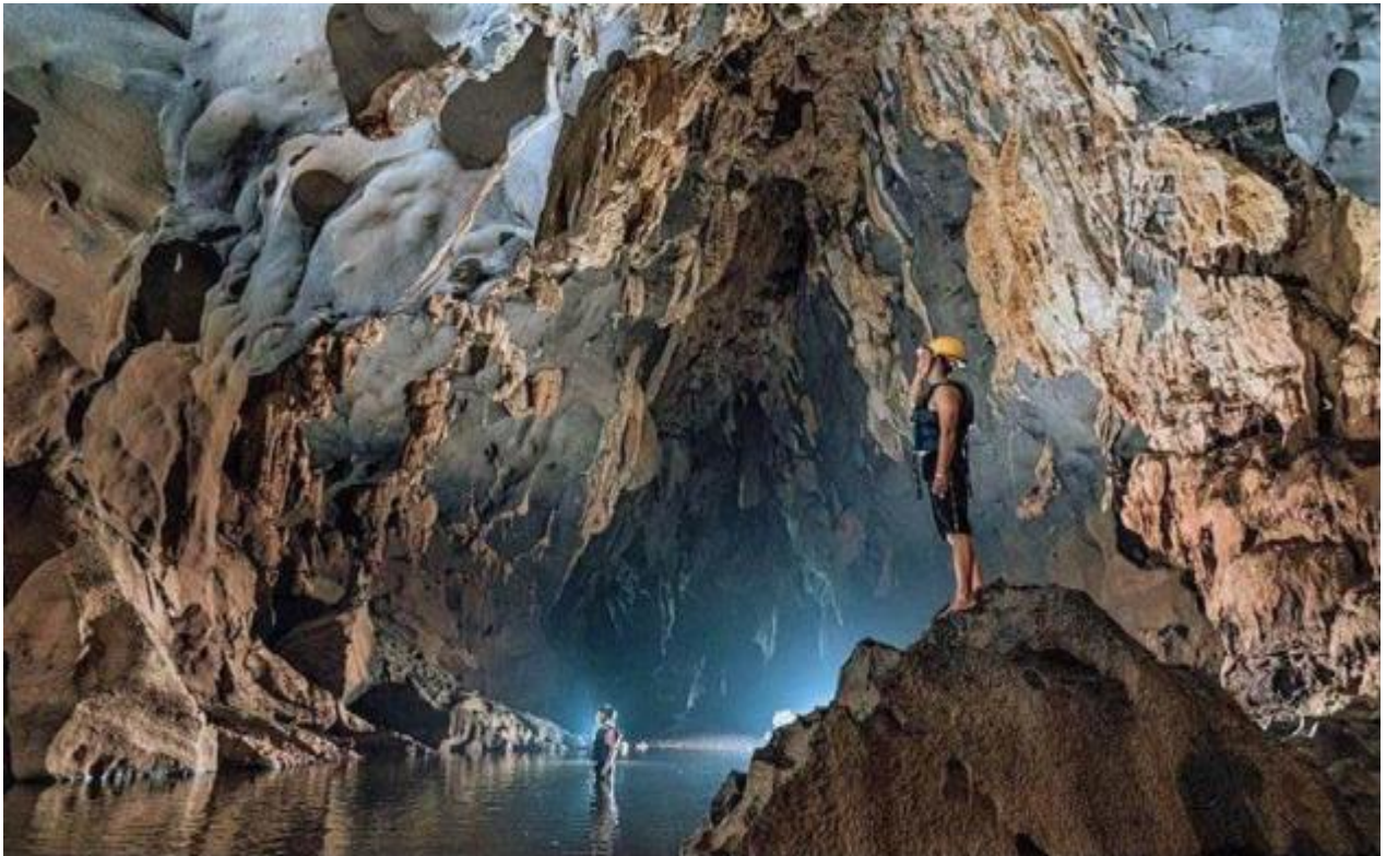
(Image: The Dark and Bright cave – Lan Ha Bay – Quang Ninh – Vietnam)