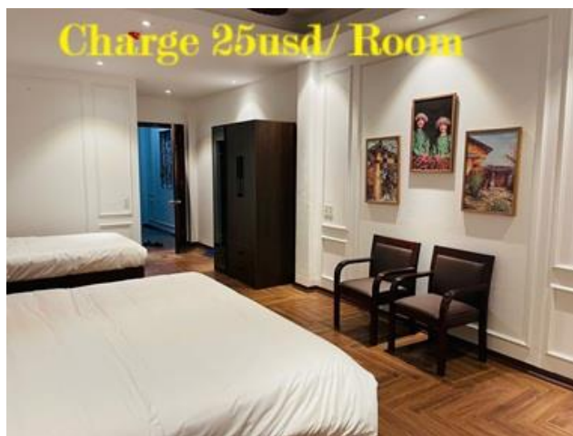
(Image: 1. Free homestay accommodation, 2. Hotel room offering more comfort and privacy – USD 25/room/night – Ha Giang, Vietnam)