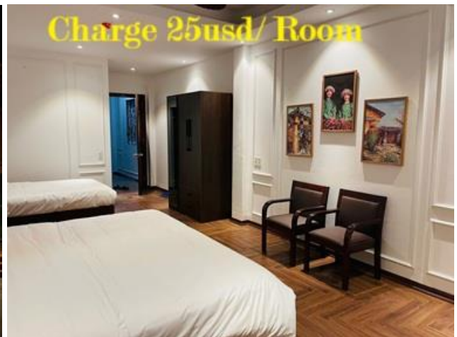
(Image: 1. Free homestay accommodation, 2. Hotel room offering more comfort and privacy – USD 25/room/night – Ha Giang, Vietnam)