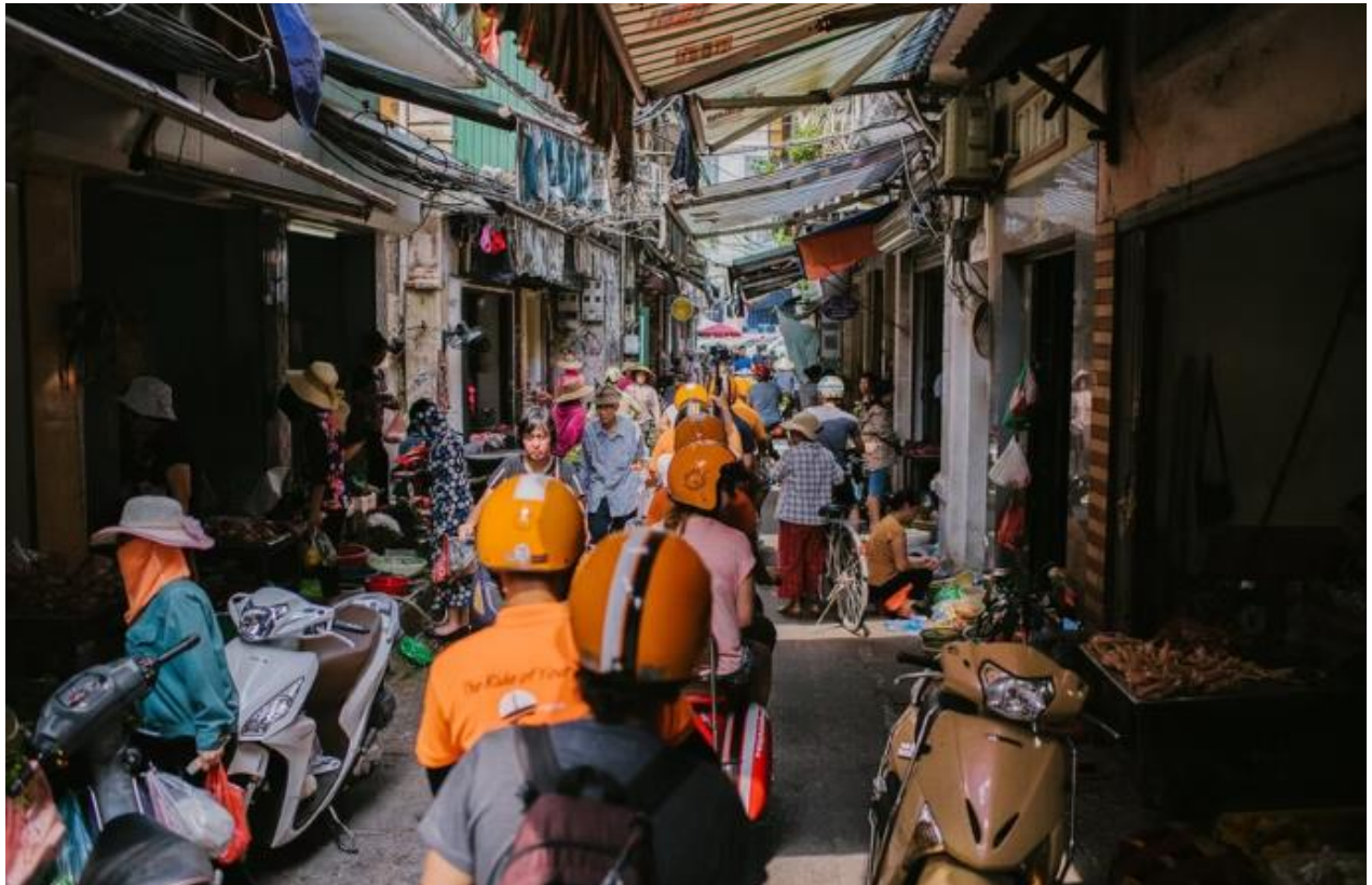
(Image: Drive through narrow alleyways, wet market and hidden residential neighborhoods – Ha Noi – Vietnam)