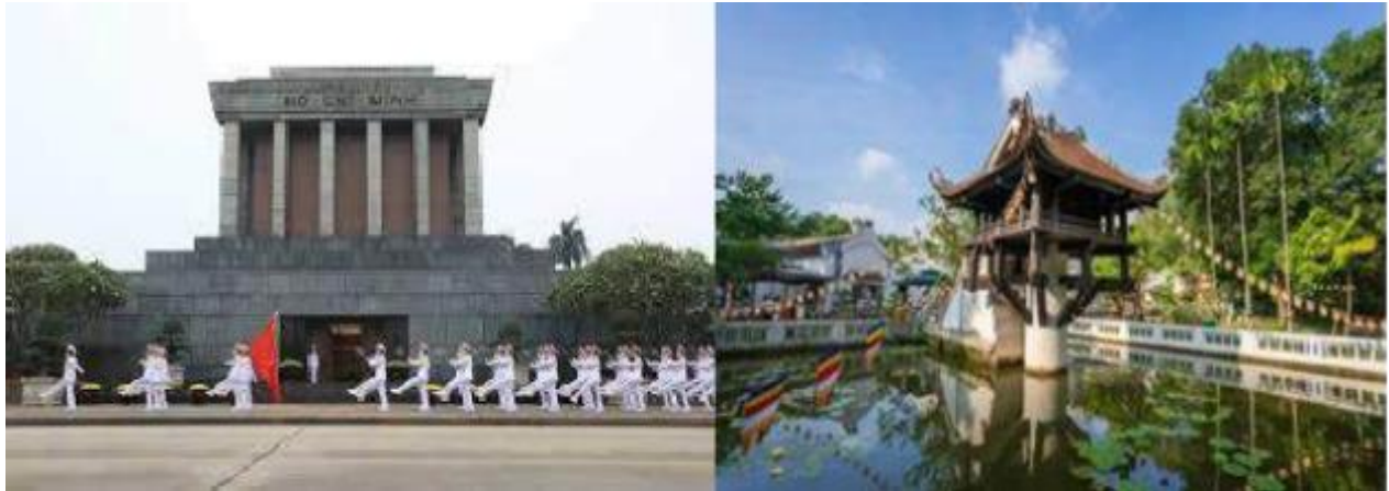
(Image: 1. Ho Chi Minh Mausoleum; 2. One Pillar Pagoda – Ha Noi – Vietnam)

Office: 3 Hung Hoa St | Hai Chau Dist | Da Nang | Viet Nam Australia Representative: 6 Hinton St | Runcorn QLD 4113 Hotline: +61481957246 / +84905122315 Email: info@vietnamlovelytravel.com Website: http://www.vietnamlovelytravel.com International Tour Operator Licence No: 48-297/2022 /TCDL-GP LHQT