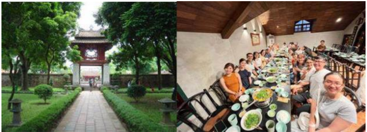
(Image: 1. Temple of Literature; 2. “Cha ca Lang” lunch – Ha Noi – Viet Nam)