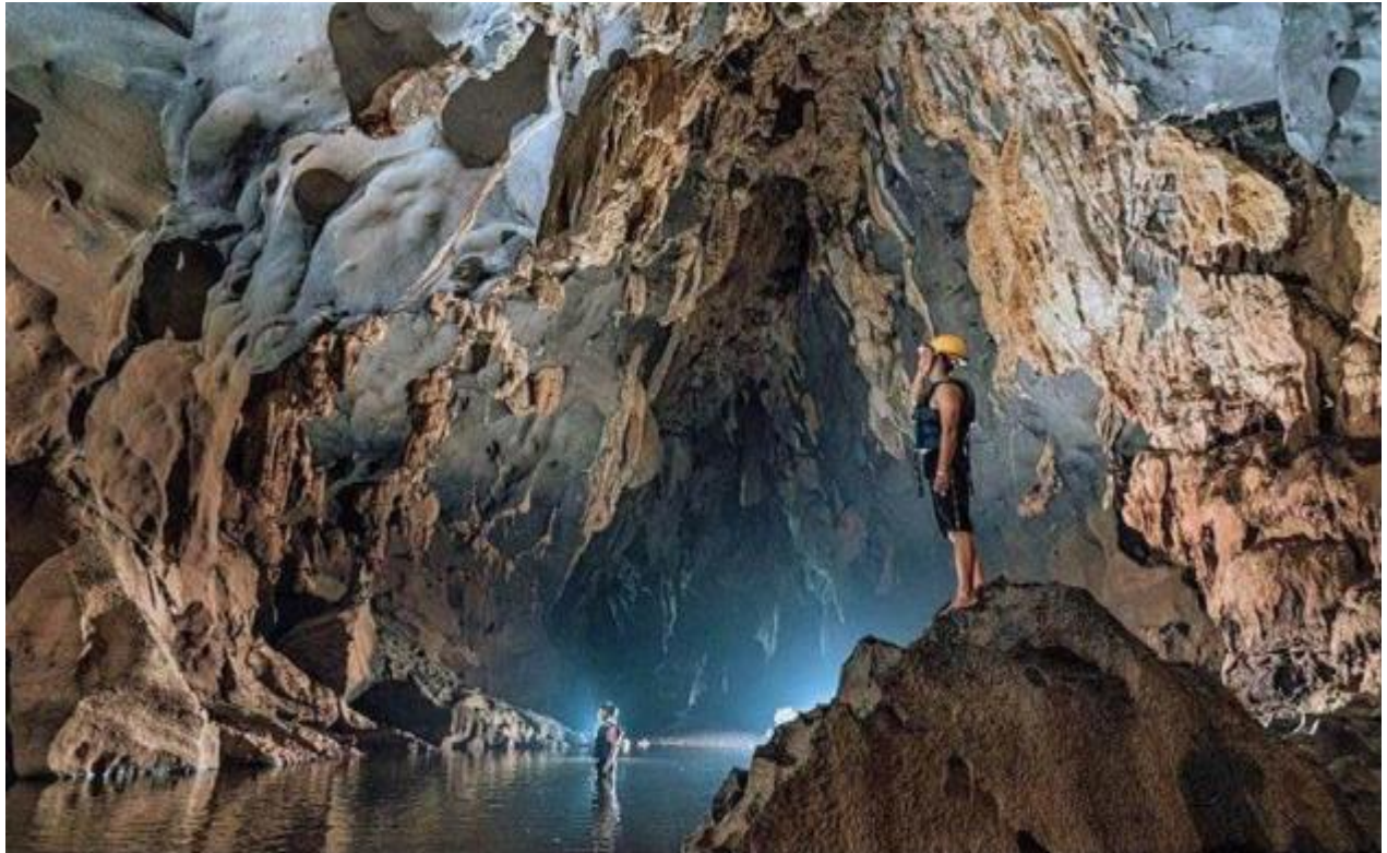
(Image: The Dark and Bright cave – Lan Ha Bay – Quang Ninh – Vietnam)