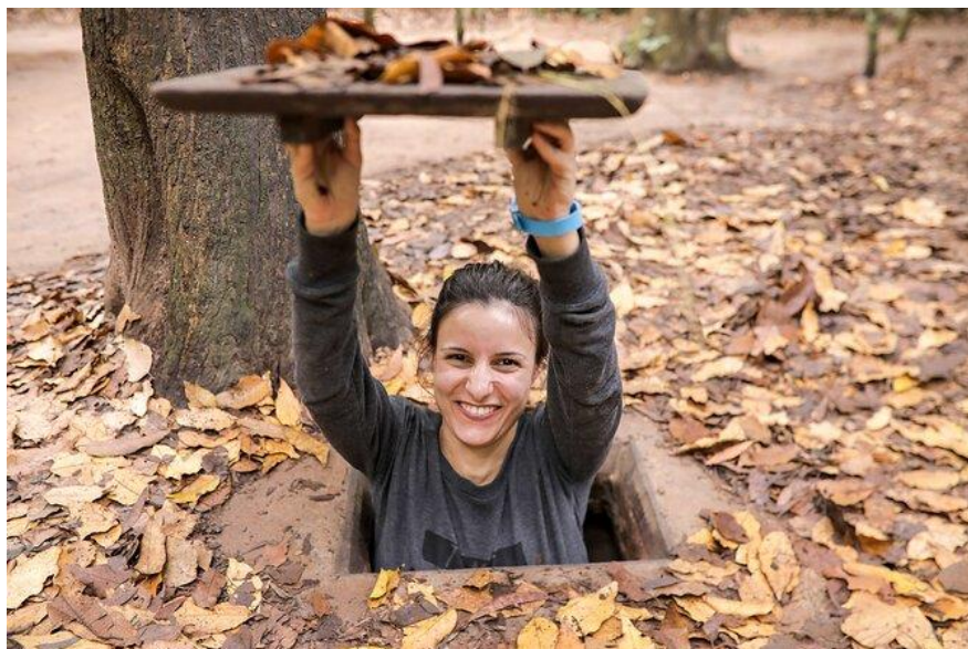
(Image: Crawling through a tunnel - An unforgettable experience in Cu Chi Tunnels – Ho Chi Minh)