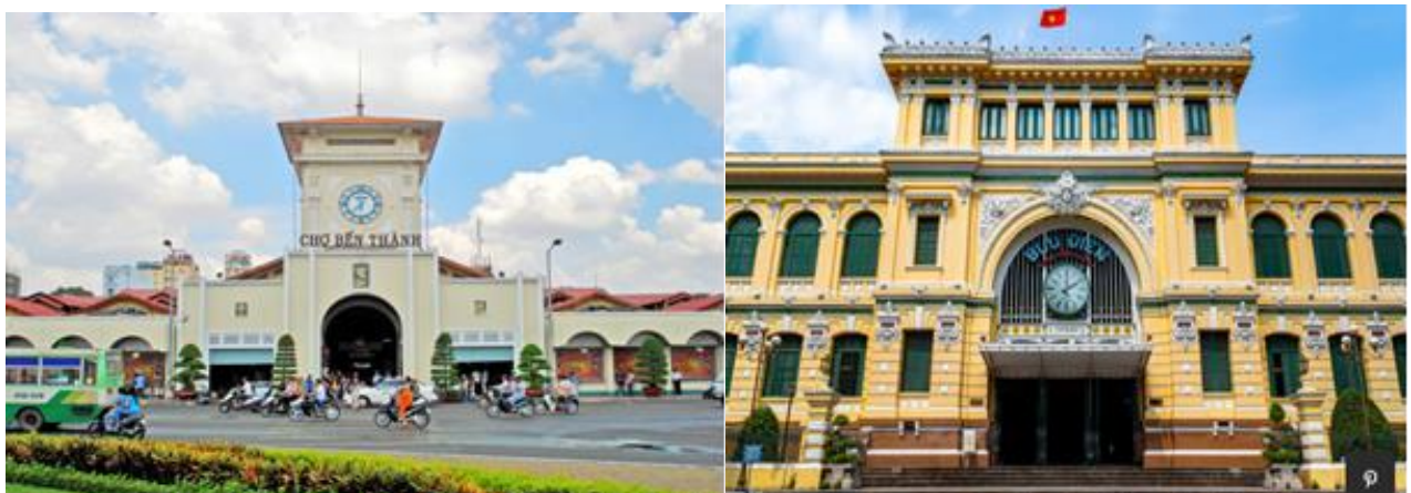
(Image: 1. Ben Thanh Market; 2. Ho Chi Minh Post Office – Ho Chi Minh – Vietnam)