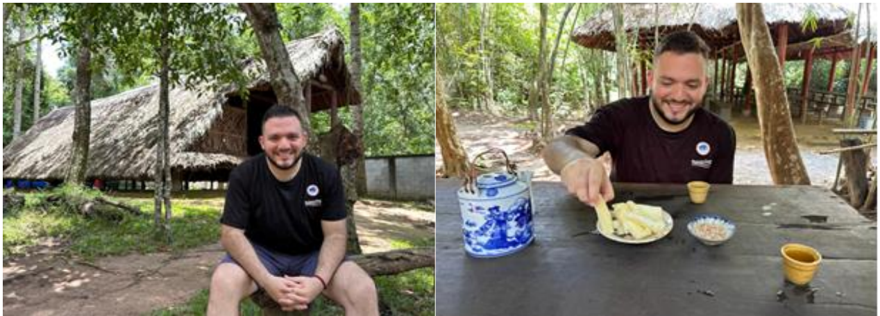
(Image: Our traveler is trying Cassava in Cu Chi Tunnels – Ho Chi Minh – Vietnam)