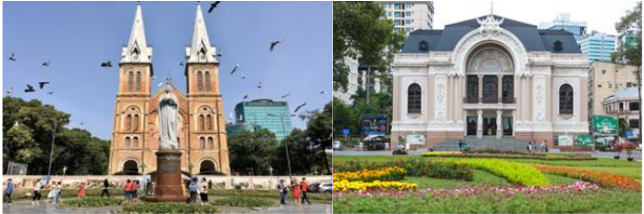
(Image: 1. Notre Dame Cathedral; 2. Opera House – Ho Chi Minh – Vietnam)

Conclude your tour at the bustling, alive with energy and local specialties. Finishing with the bustling Ben Thanh Market buzzes with energy and local specialties.