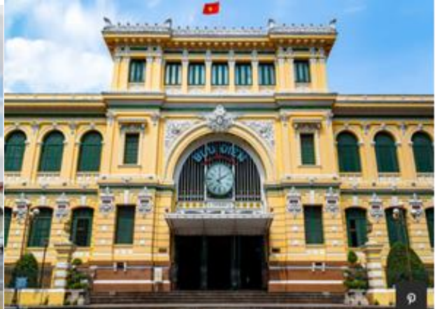
(Image: 1. Ben Thanh Market; 2. Ho Chi Minh Post Office – Ho Chi Minh – Vietnam)