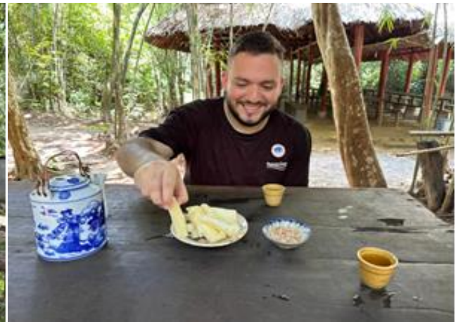
(Image: Our traveler is trying Cassava in Cu Chi Tunnels – Ho Chi Minh – Vietnam)