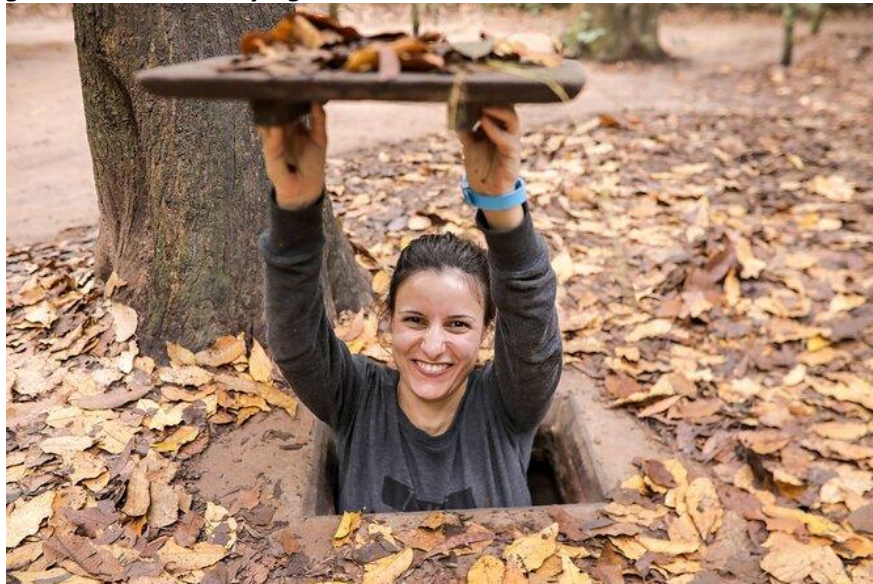
(Image: Crawling through a tunnel - An unforgettable experience in Cu Chi Tunnels – Ho Chi Minh)