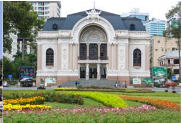
(Image: 1. Notre Dame Cathedral; 2. Opera House – Ho Chi Minh – Vietnam)