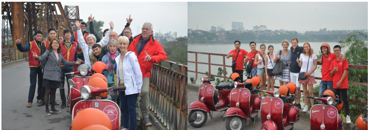
(Image: Check-in at Long Bien Bridge and West Lake – Ha Noi – Vietnam)