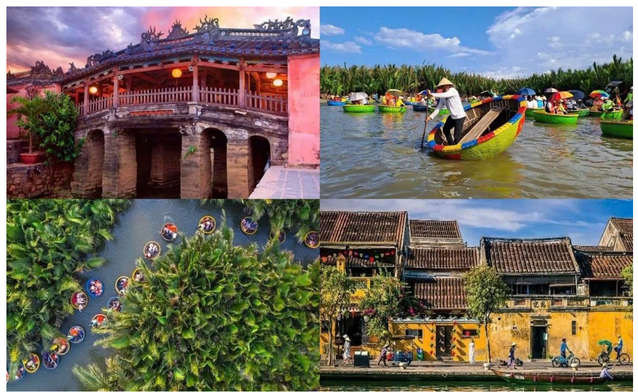
(Image: Pagoda Bridge, Cam Thanh Coconut Forest, Hoi An Ancient Town – Hoi An – Vietnam)