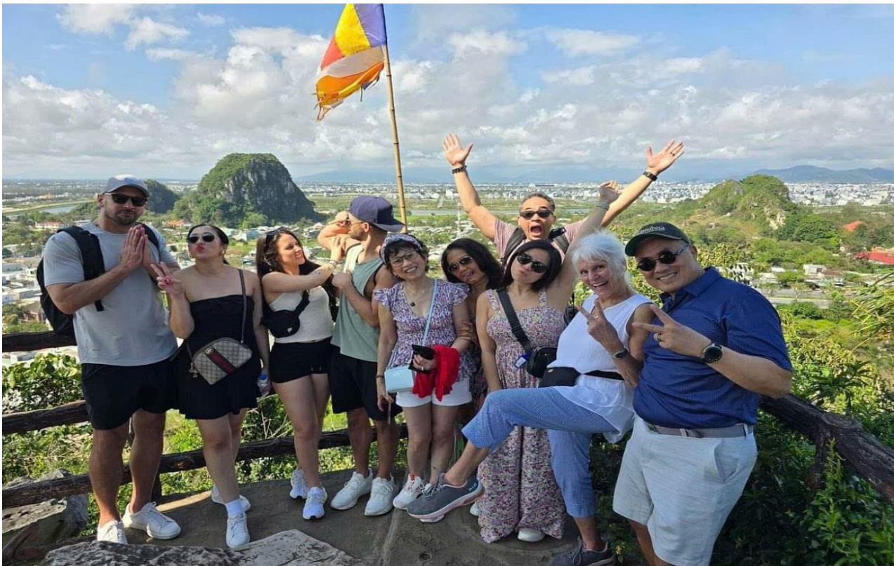
(Image: River-Viewing Pavilion, Marble Mountains – Da Nang – Vietnam)

• 20:00 : Return to your hotel, enjoy leisure time, and stay overnight in Da Nang.