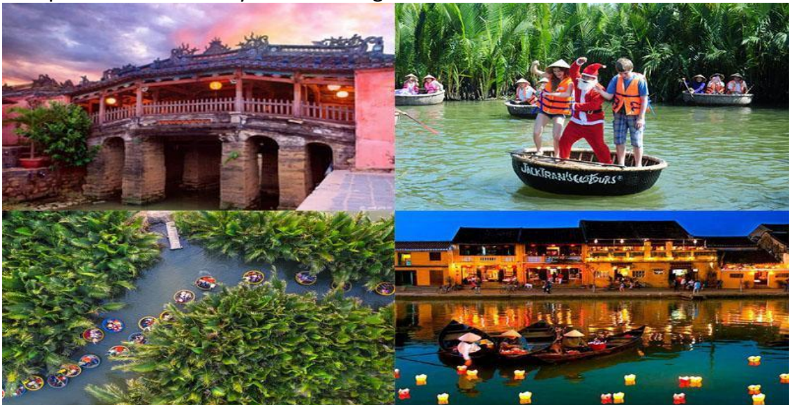
(Image: Pagoda Bridge, Cam Thanh Coconut Forest, Hoi An Ancient Town – Hoi An – Vietnam)