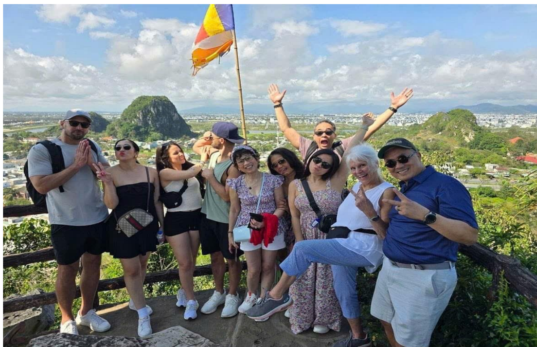
(Image: River-Viewing Pavilion, Marble Mountain – Da Nang – Vietnam)