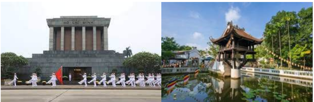
(Image: 1. Ho Chi Minh Mausoleum; 2. One Pillar Pagoda – Ha Noi – Vietnam)