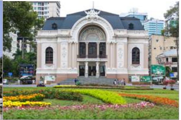
(Image: 1. Notre Dame Cathedral; 2. Opera House – Ho Chi Minh – Vietnam)