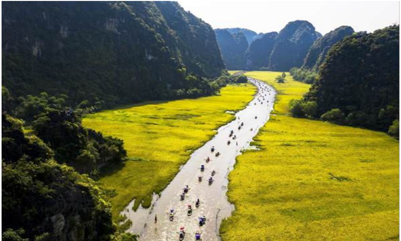
(Image: Tam Coc during ripening rice season in the end of May – Ninh Binh)

International Tour Operator Licence No: 48-297/2022 /TCDL-GP LHQT