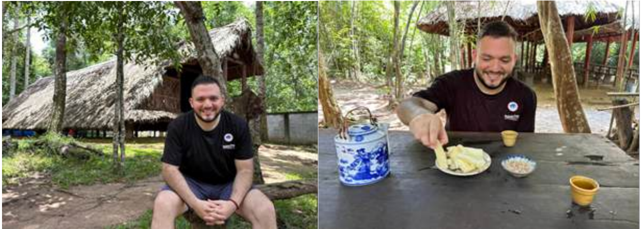
(Image: Tourist try eating Cassava in Cu Chi Tunnels – Ho Chi Minh – Vietnam)

International Tour Operator Licence No: 48-297/2022 /TCDL-GP LHQT