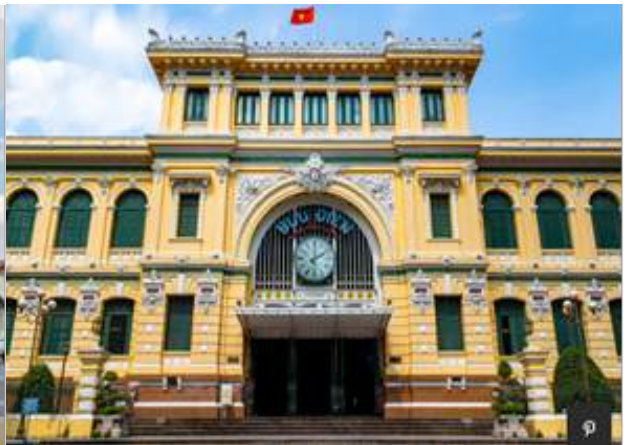
(Image: 1. Ben Thanh Market; 2. Ho Chi Minh Post Office – Ho Chi Minh – Vietnam)