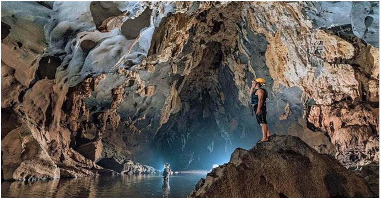
(Image: The Dark and Bright cave – Lan Ha Bay – Quang Ninh – Vietnam)