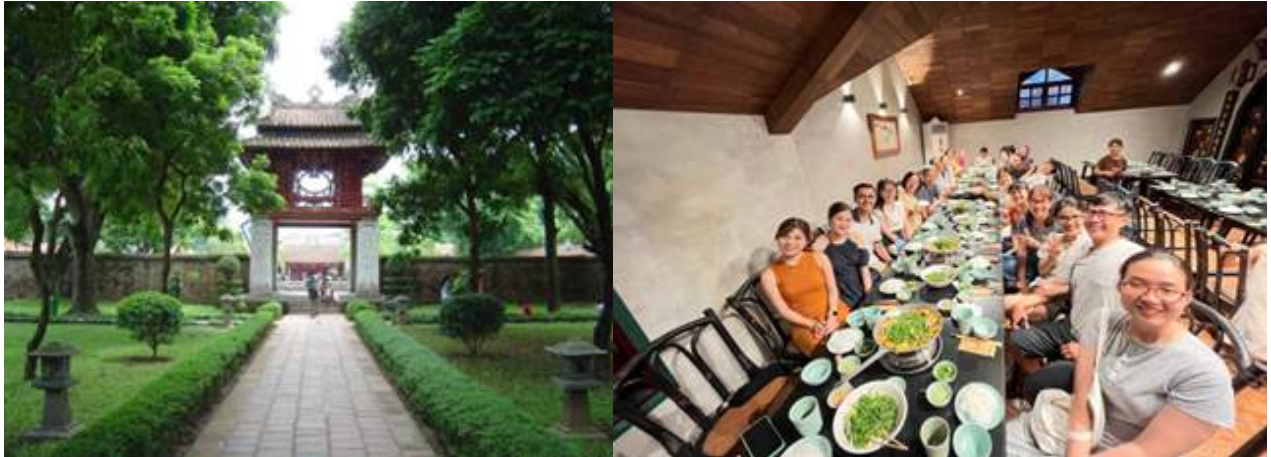
(Image: 1. Temple of Literature; 2. “Cha ca Lang” lunch – Ha Noi – Viet Nam)

International Tour Operator Licence No: 48-297/2022 /TCDL-GP LHQT