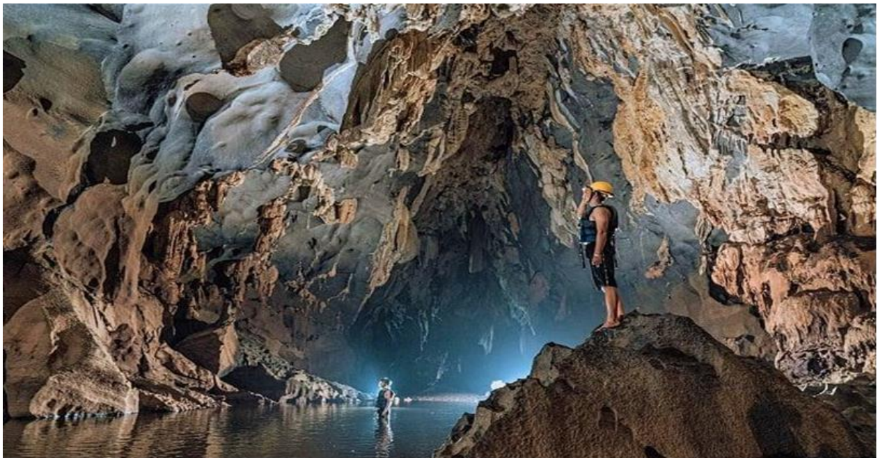
(Image: The Dark and Bright cave – Lan Ha Bay – Quang Ninh – Vietnam)