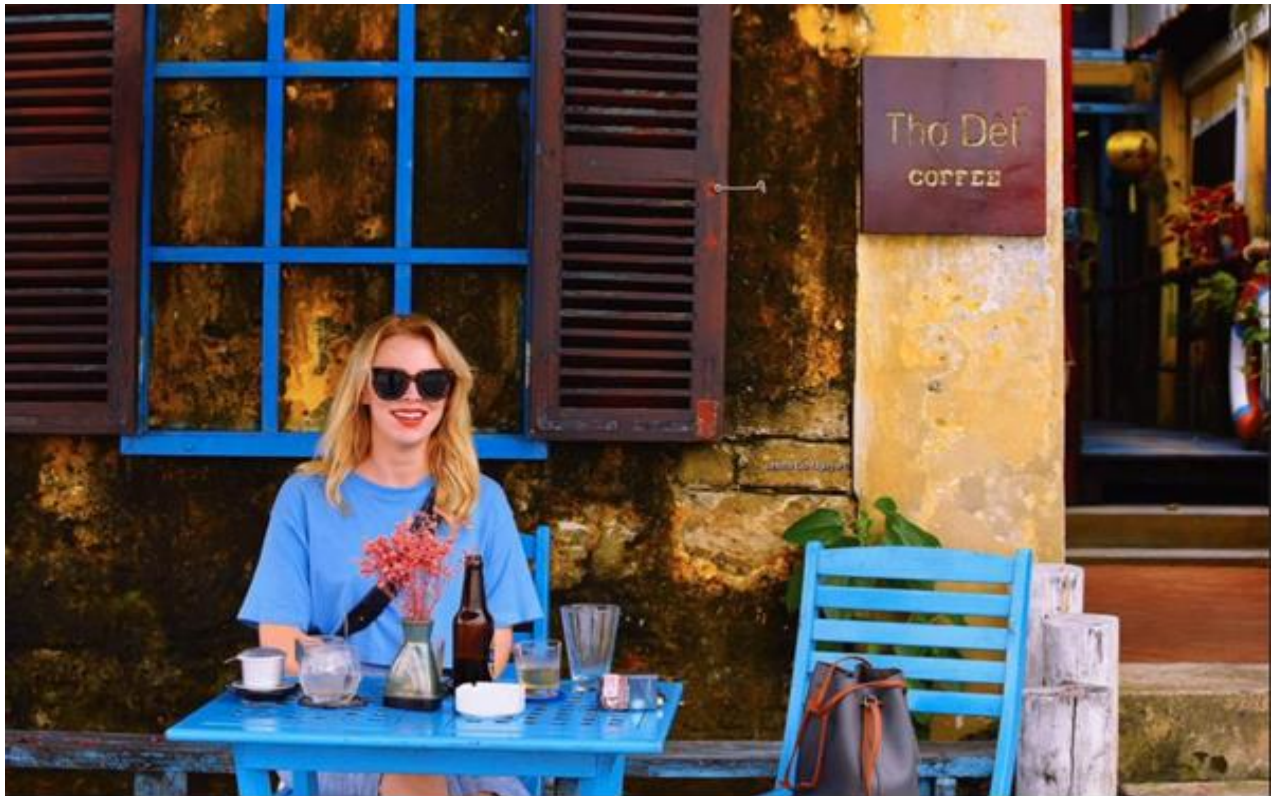
(Image: Local coffee and beer in Hoi An Ancient Town – Hoi An – Vietnam)

International Tour Operator Licence No: 48-297/2022 /TCDL-GP LHQT