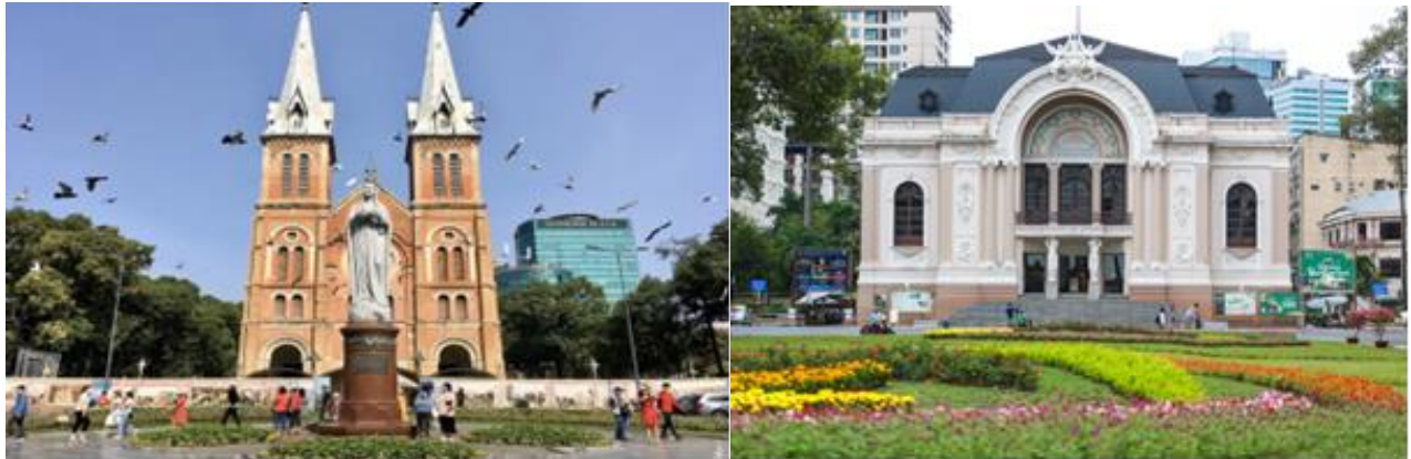
(Image: 1. Notre Dame Cathedral; 2. Opera House – Ho Chi Minh – Vietnam)

International Tour Operator Licence No: 48-297/2022 /TCDL-GP LHQT