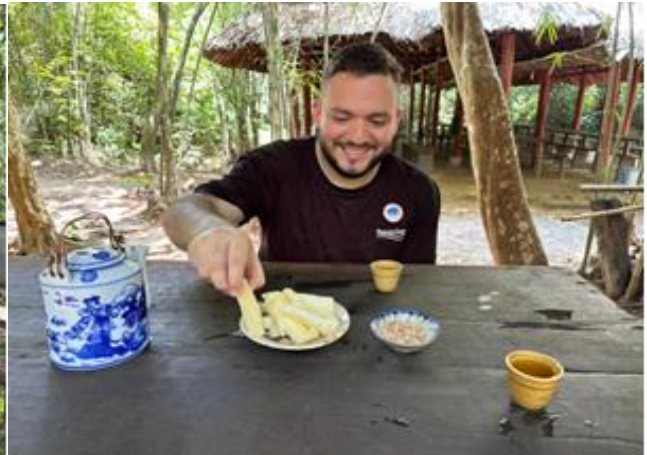
(Image: Our traveler is trying Cassava in Cu Chi Tunnels – Ho Chi Minh – Vietnam)