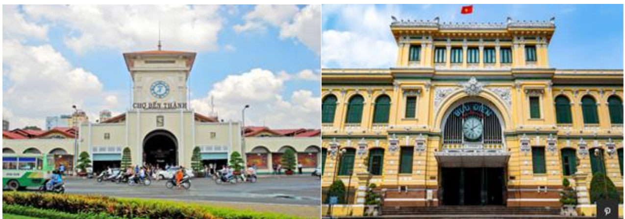
(Image: 1. Ben Thanh Market; 2. Ho Chi Minh Post Office – Ho Chi Minh – Vietnam)