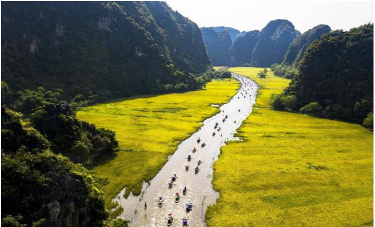
(Image: Tam Coc during ripening rice season in the end of May – Ninh Binh)

International Tour Operator Licence No: 48-297/2022 /TCDL-GP LHQT