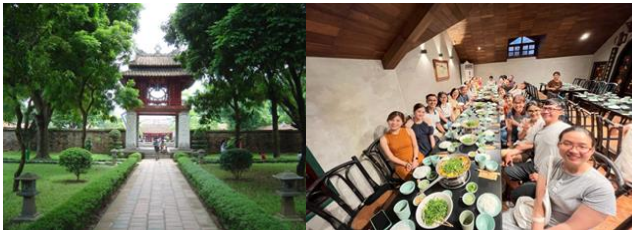
(Image: 1. Temple of Literature; 2. “Cha ca Lang” lunch – Ha Noi – Viet Nam)