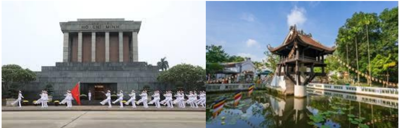
(Image: 1. Ho Chi Minh Mausoleum; 2. One Pillar Pagoda – Ha Noi – Vietnam)