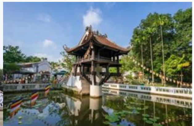
(Image: 1. Ho Chi Minh Mausoleum; 2. One Pillar Pagoda – Ha Noi – Vietnam)