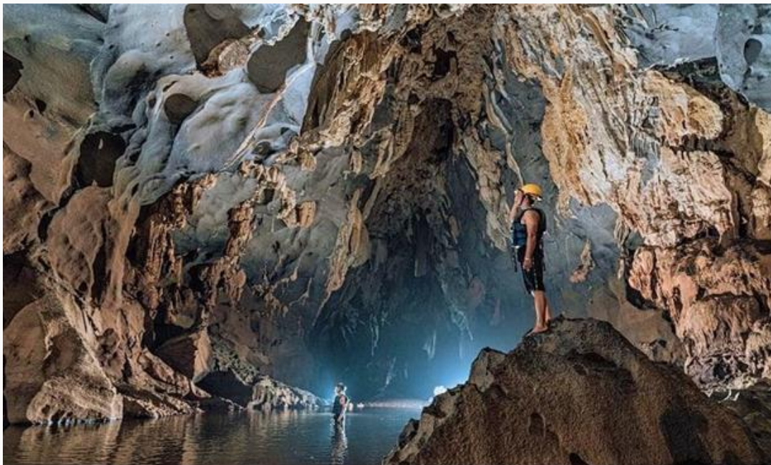
(Image: The Dark and Bright cave – Lan Ha Bay – Quang Ninh – Vietnam)