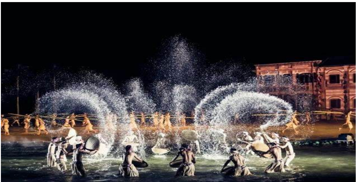
(Image: Hoi An Memories Show, Hoi An Ancient Town – Hoi An – Vietnam)