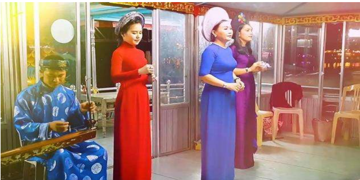
(Image: Hue traditional singing on the Perfume River – Hue – Vietnam)