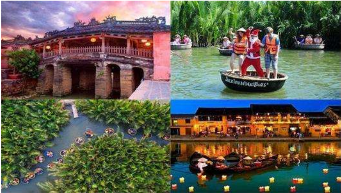
(Image: Pagoda Bridge, Cam Thanh Coconut Forest, Hoi An Ancient Town – Hoi An – Vietnam)

International Tour Operator Licence No: 48-297/2022 /TCDL-GP LHQT