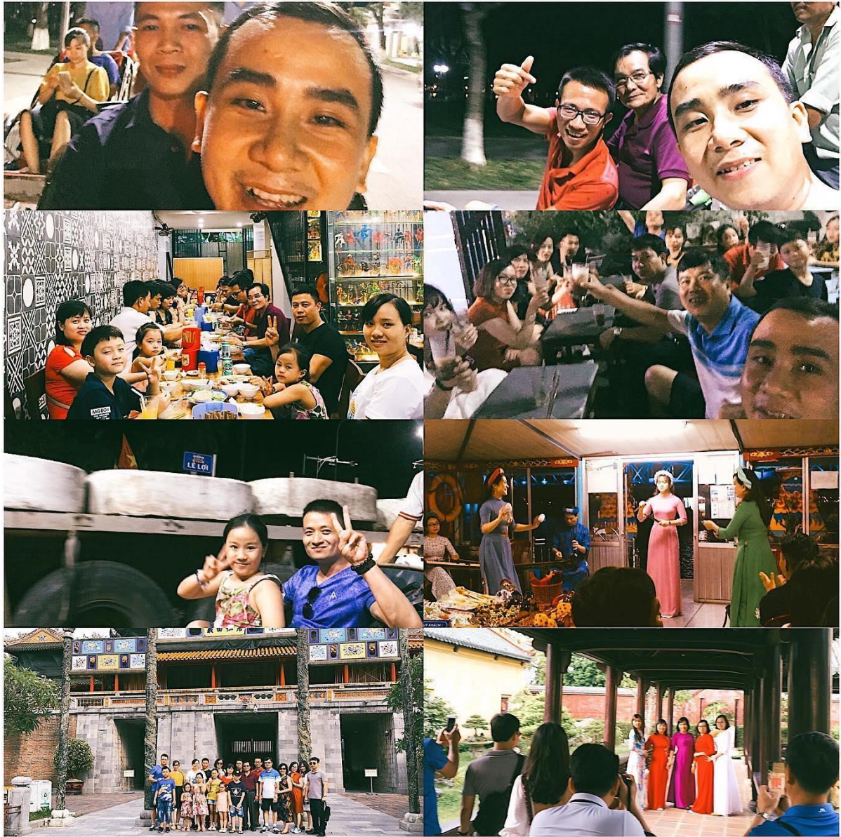
DAY 5: Hue - Hoi An (ESG/Breakfast/Lunch/ Dinner)